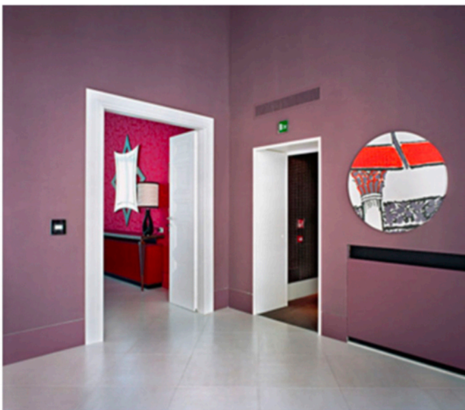
Lynne Cohen , Untitled (Mauve Wall) , 2010. Épreuve à développement chromogène, 1/5 101,7 x 127,4 cm. Achat, grâce au Symposium des collectionneurs 2012, Banque Nationale Gestion privée 1859 Collection Musée d'art contemporain de Montréal