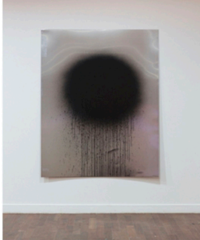
Jinny Yu , Black Matter , 2013. Ink on aluminum, 69"x43".

Please note that images are for illustrative purposes; loan requests are pending.